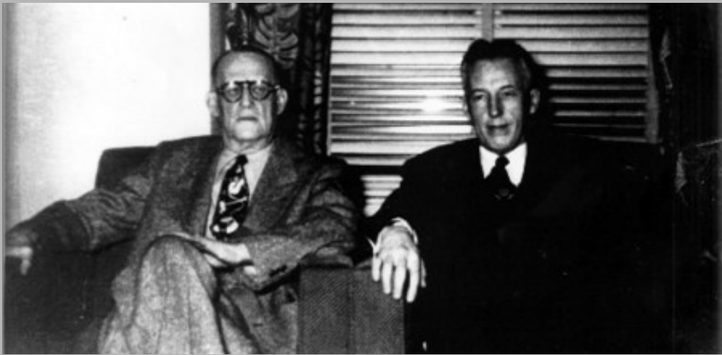
Dr. Bob and Bill W., Founders of AA

How Did it all Begin: Providence or Coincidence?