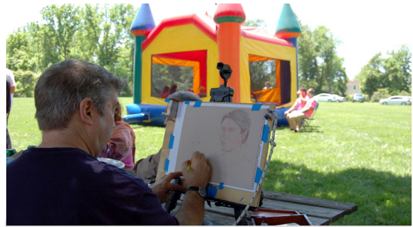
Artists and Entertainment at 2014 Picnic.

“It has developed into Livengrin's biggest fundraiser,” she said. “Every year it gets better.” This year some new things will be added to the event. The picnic will include specialty food vendors who will be selling funnel cake and other