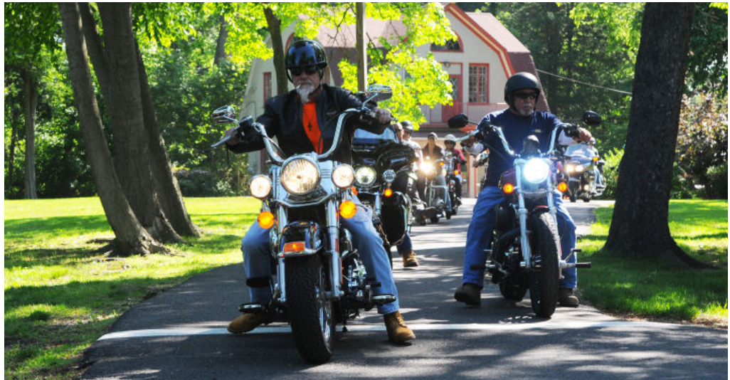
Bikers from 2014 Poker Run.

Livengrin's Ride for Recovery is Right Around the Corner