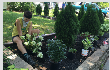
Top: Bringing new life to the pond at Blue Ridge. Bottom: Revamping the garden at River.