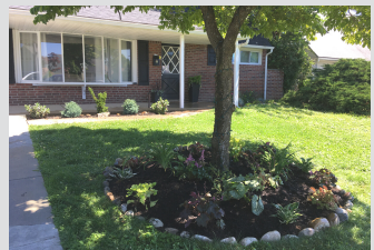
Top: Making a new bed at 60 Jonquil. Bottom: Full bed of plants around the tree and in front of the house.