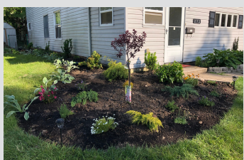
Top: In process at Birch. Bottom: Brand new flower bed, complete with flowers and evergreens.