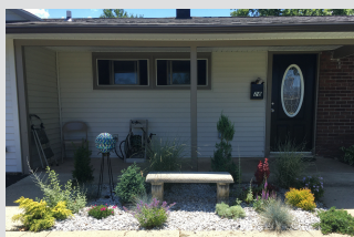
Top: The front bed at apple tree, with several new flowers and plants. Bottom: New additions to Inkberry's front stone garden.