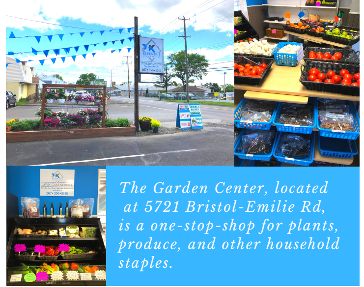
The Garden Center, located at 5721 Bristol-Emilie Rd, is a one-stop-shop for plants, produce, and other household staples.